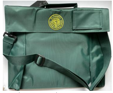
Book Bag with strap £5